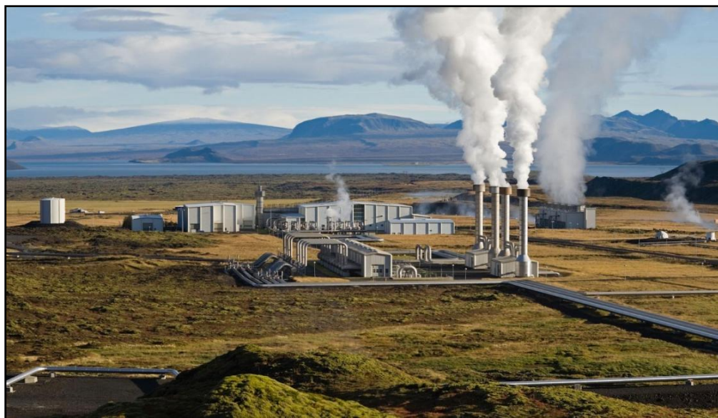
Nesjavellir Geothermal Power Station in Iceland